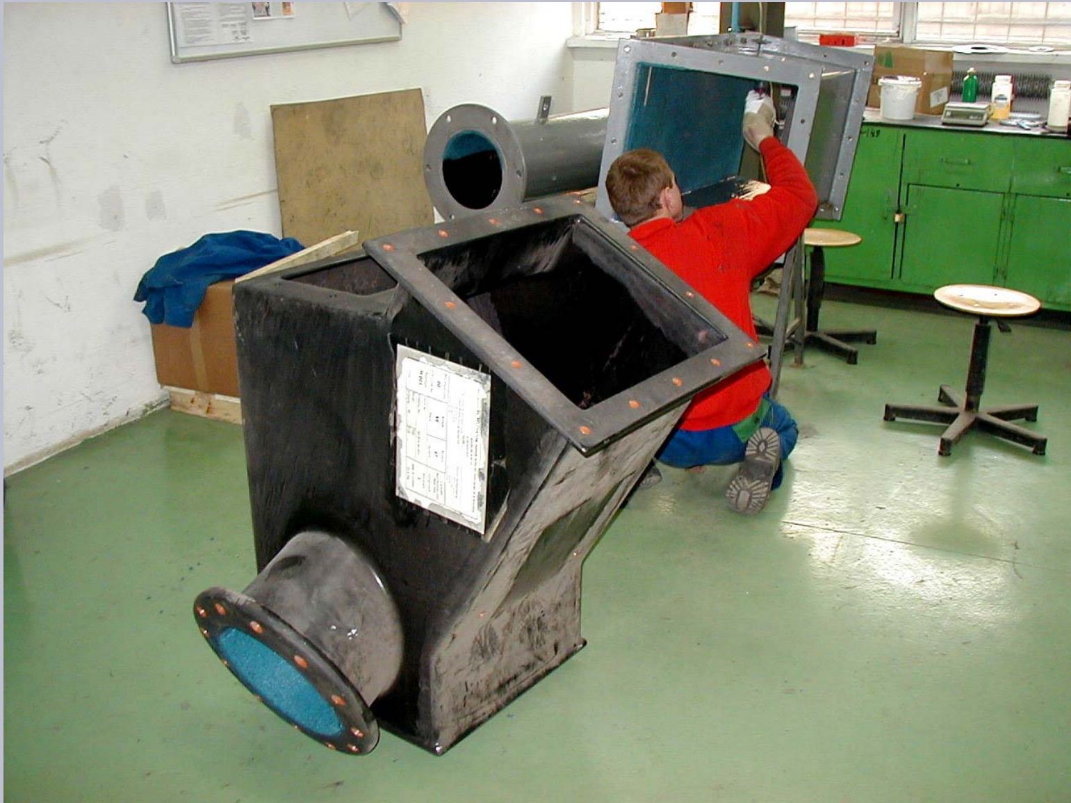
New chutes being lined with ARC MX1.