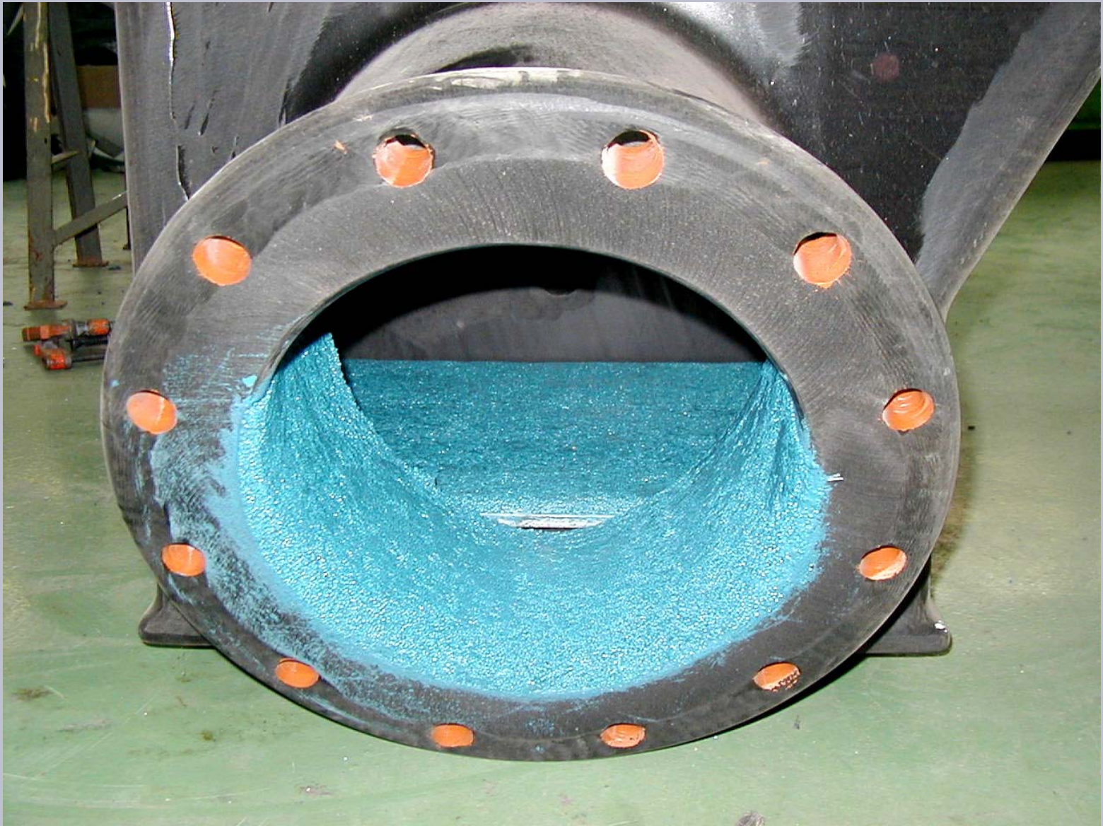
Close up view of ARC MX1 lining in new chute.