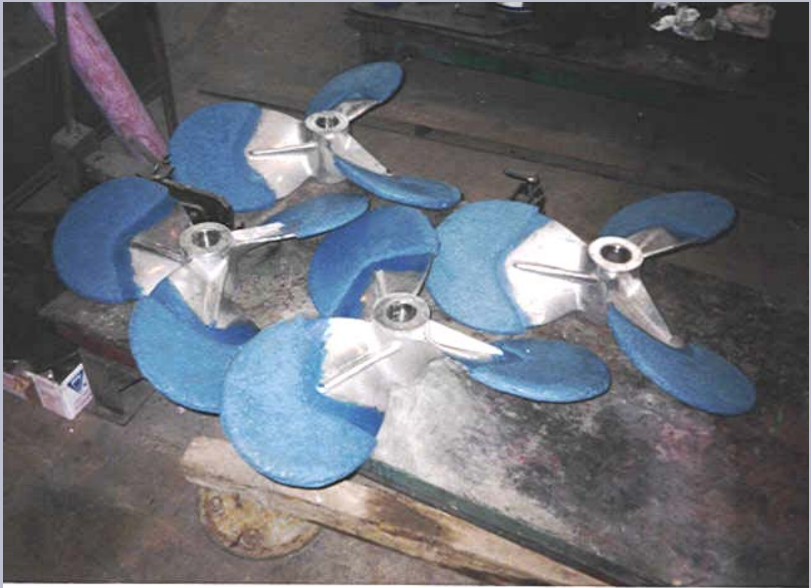
Coal fired power plant FGD wet scrubber absorber mixers protected with ARC MX1 on blade tips.